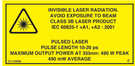
Xcyte Class IIIb

Xcyte 20/60/100 mW lasers are Class IIIb lasers as defined by the Federal Register 21 CFR 1040.10 Laser Safety Standard. The Standard requires that certain performance features and laser safety labels be provided on the product. EMC Declaration of Conformity. UL Mark.