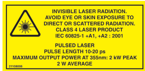
Xcyte Class IV

Xcyte 150mW lasers are Class IV lasers as defined by the Federal Register 21 CFR 1040.10 Laser Safety Standard. The Standard requires that certain performance features and laser safety labels be provided on the product. EMC Declaration of Conformity. UL Mark.