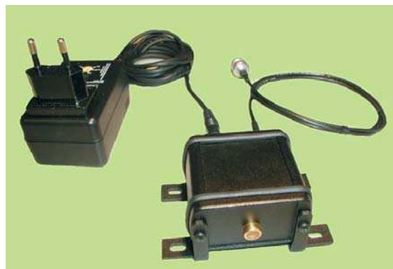
Fig. 1: Photomicrograph of the id Quantique's id100-20.

For parallel measurements , id Quantique has introduced the id150. This 1x10 linear array of single photon detectors is the first commercially available product allowing high throughput parallel photon counting and timing measurements ( http://www.idquantique.com/spcm-vis-10.html ). For further information on our products, please contact id Quantique by phone: +41 (0)22 301 83 71, fax: +41 (0)22 301 83 79, or email: sales@idquantique.com . Note that id Quantique also offers photon counting modules operating in the infrared and short-pulse laser sources. Custom developments of single photon sensors including arrays are possible.